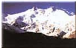
Nanga Parbat, 8125 m