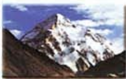
K-2, 8611 m

Experience all the radiant colours of nature and cultures in the country where the beauty surpasses imagination.