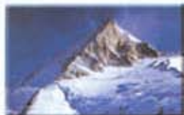
Gasherbrum II, 8035 m