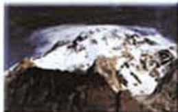
Broad Peak, 8051 m